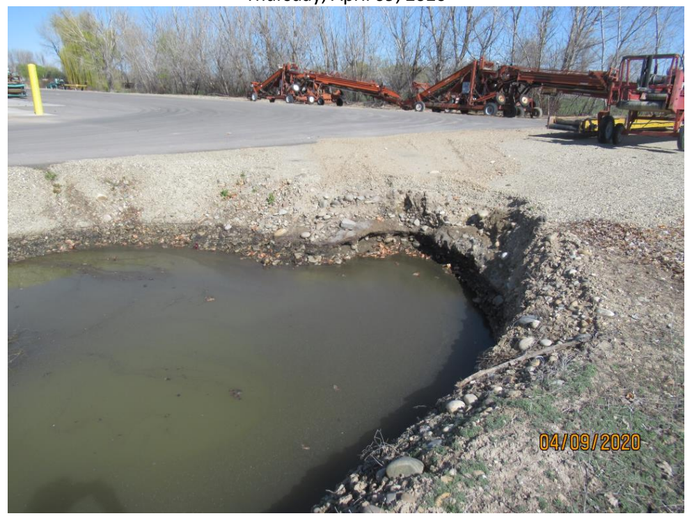
Photograph 35 :Swale #2, north end, looking north.