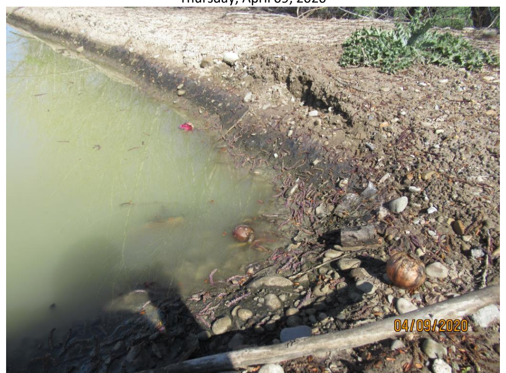
Photograph 43 :Close-up view of Swale #3, northeast end, note onion and onion husks.