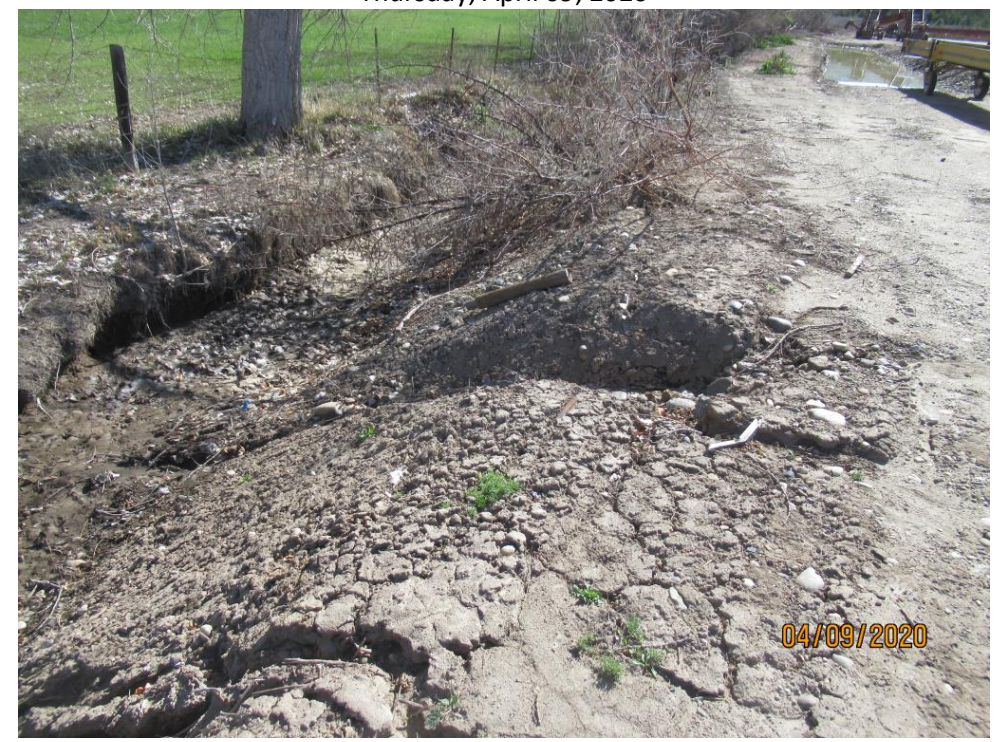
Photograph 61: Large rill on facility property into north side irrigation ditch, looking east.