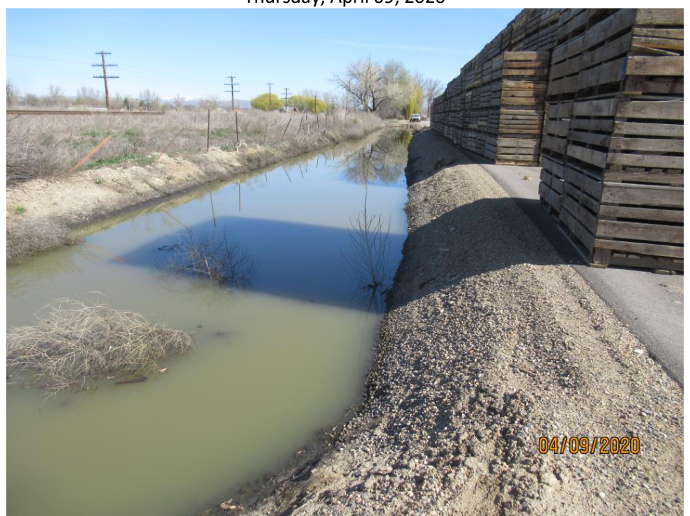
Photograph 69: Swale #4, looking north from the south end.