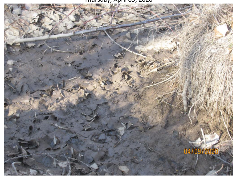
Photograph 17 :Close-up view of irrigation ditch area observed in video attached to complaint file, Complaint #160717 Video.mov.