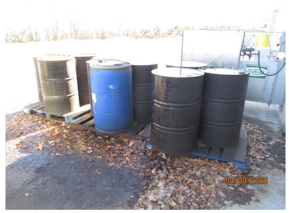
Photograph 51 :Refrigeration oil drums, stored near Swale #3, looking east, second view.