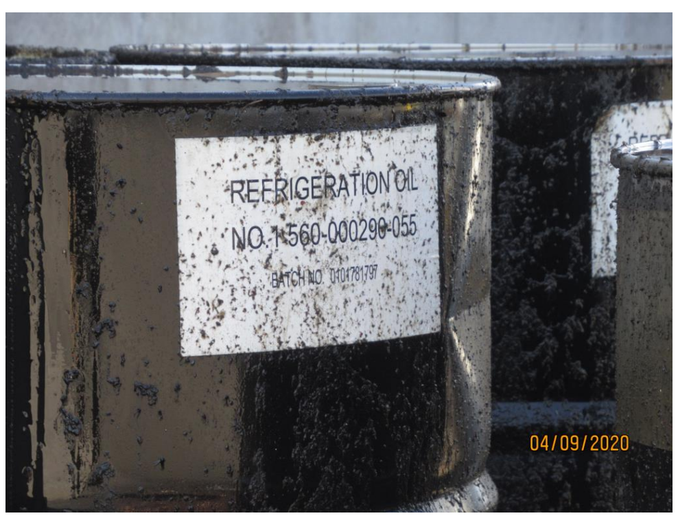
Photograph 46: Label on one of the drums indicating refrigeration oil.