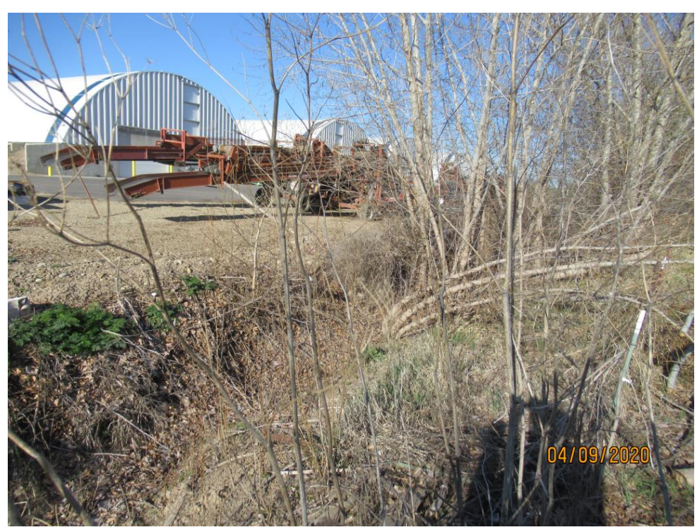
Photograph 4: Irrigation ditch located on the north side of the facility, looking west.