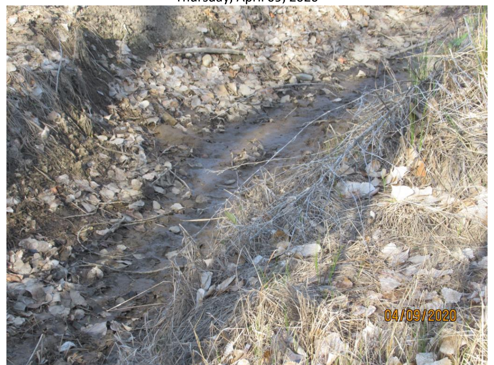
Photograph 15 :Close-up view of irrigation ditch on north side of the property, looking west, moist soil in bottom of irrigation ditch.