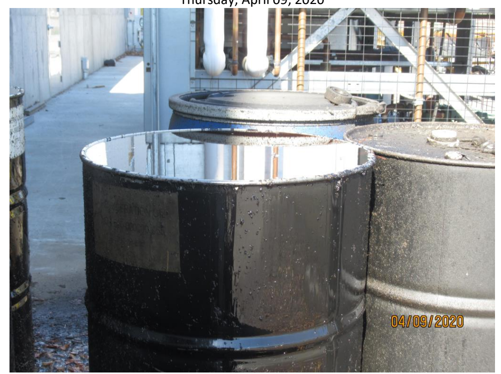
Photograph 47 :Refrigeration oil drums, note oil pooling on the top and leaking around the sides.