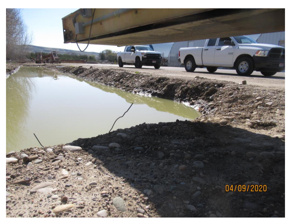
Photograph 52 :Swale #3, west end of the swale, looking east.