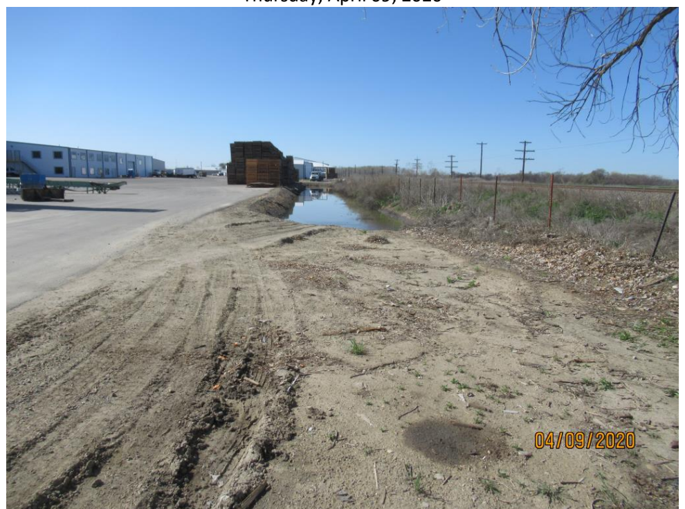
Photograph 65 :Stormwater swale, Swale #4, located on the west side of the property, looking southwest.