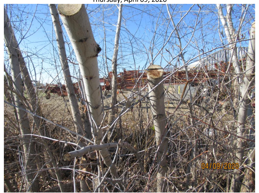
Photograph 5: View of the stormwater swale located on the northeast side of the facility, looking through vegetation facing south. Filming location for video_1 in complaint file #160717.