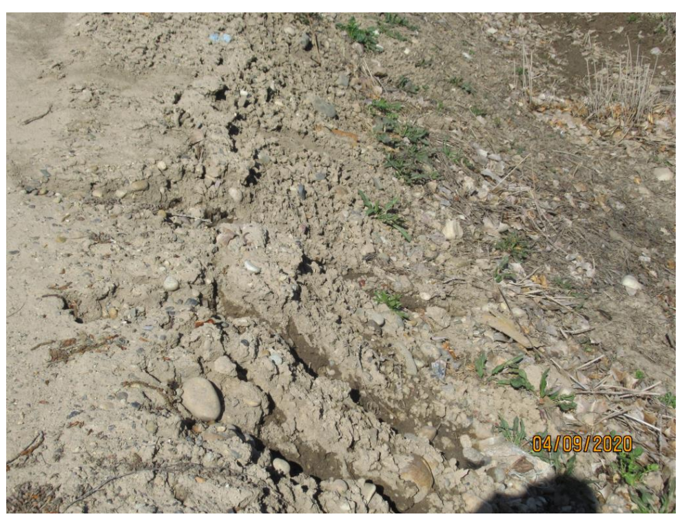
Photograph 58 :Rills on facility property into north side irrigation ditch.