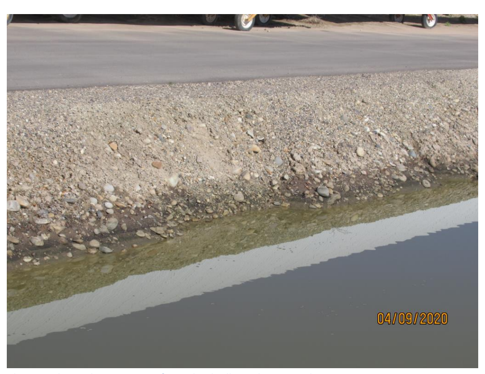
Photograph 32 :Close-up view of west bank rills, mid-way, Swale #2.