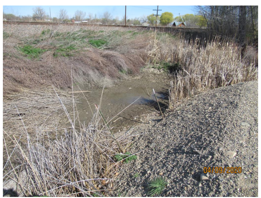
Photograph 64: Pooling water in irrigation ditch, west side of the property, looking north.