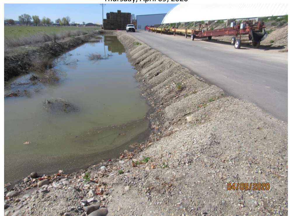
Photograph 37 :Swale #2, looking southwest. Strong onion odor noticed in this area.