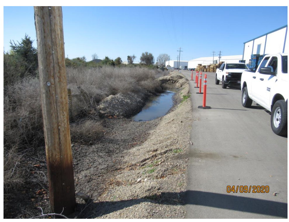
Photograph 22 :Stormwater swale, Swale #1, located on the east side of the property near the onion hopper from the largest building on the property. View is looking southwest