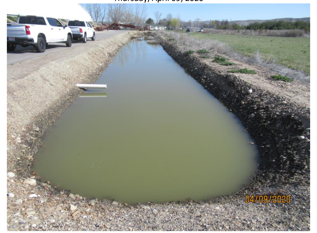
Photograph 27 :Stormwater swale, Swale #2, located on the northeast corner of the property, looking north northeast.