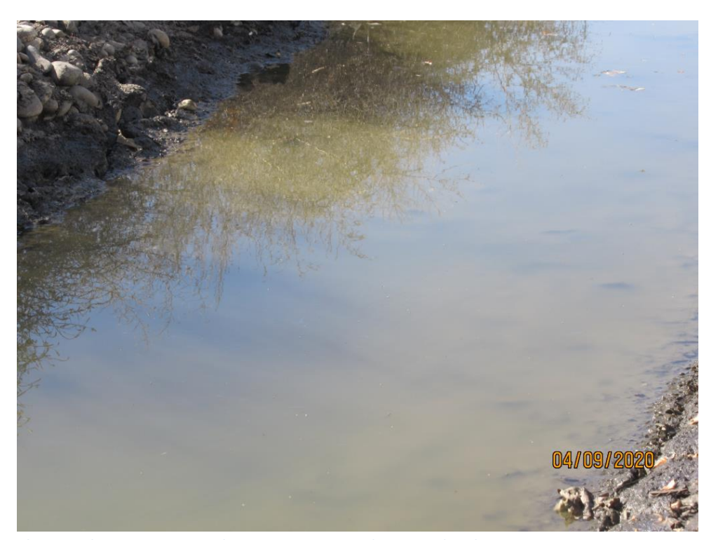
Photograph 24: Water in Swale #1. Strong onion odor noticed in this area.