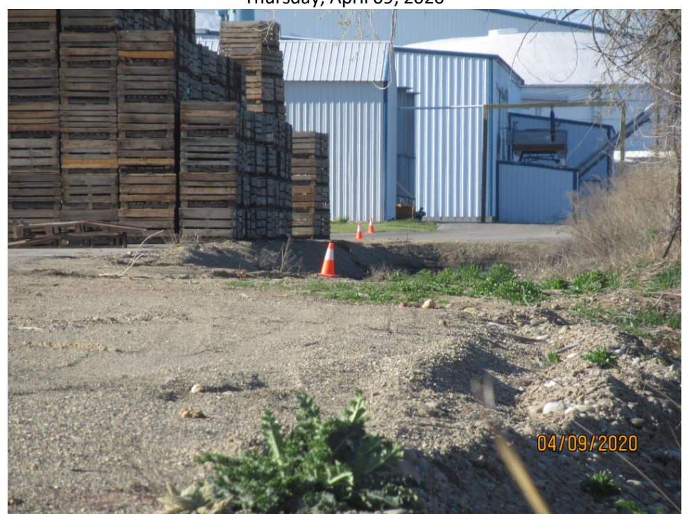
Photograph 21 :Close up view of stormwater swale located on the west side of the property, looking west.