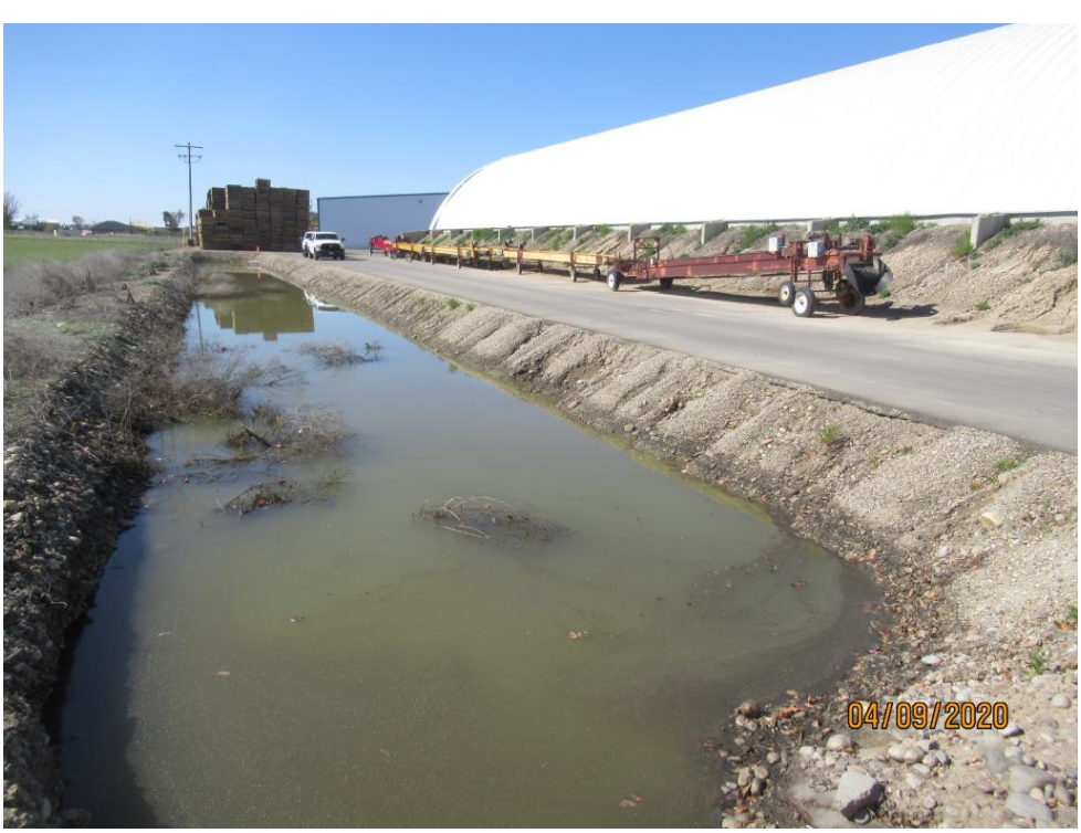
Photograph 38 :Swale #2, looking southwest, note rills on west bank.