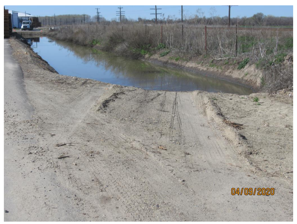
Photograph 66: Swale #4, northeast end, looking southwest, note tire tracks to edge of swale.