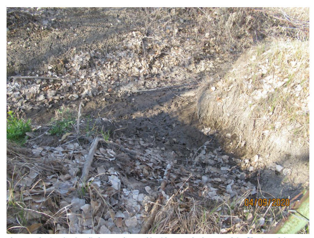
Photograph 16: Irrigation ditch area observed in video attached to complaint file, Complaint #160717 Video.mov.