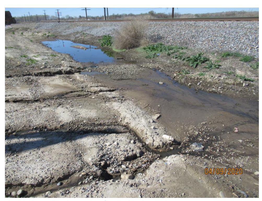
Photograph 76 :Rills and waste water from truck loading operations.