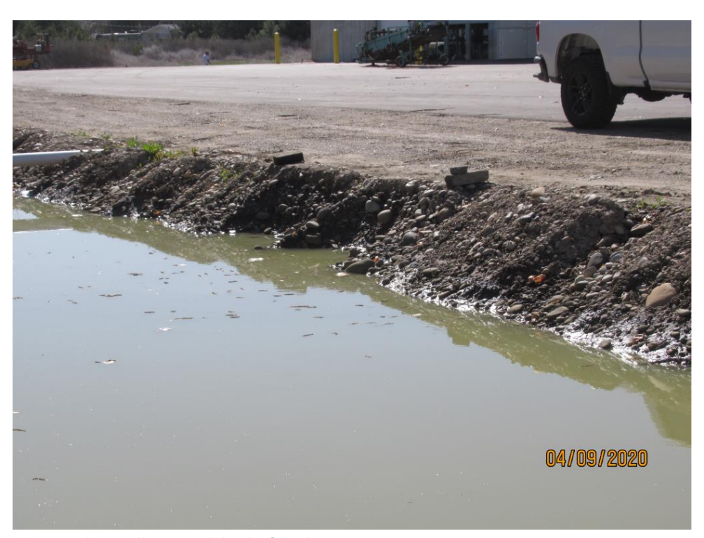
Photograph 56: Rills on south bank of Swale #3.