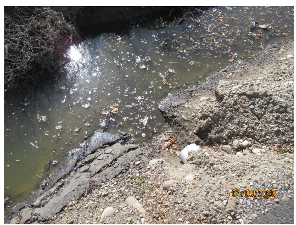
Photograph 26 :Stormwater outfall and water, Swale #1, note onion husk and debris in water.