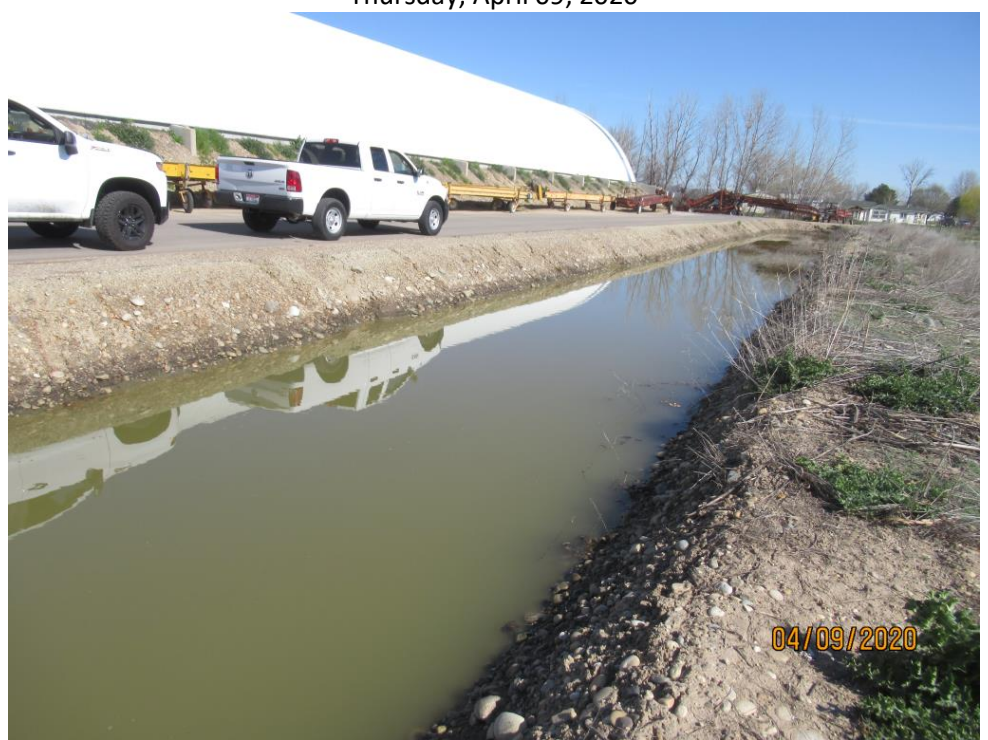
Photograph 29 :Swale #2, looking north.