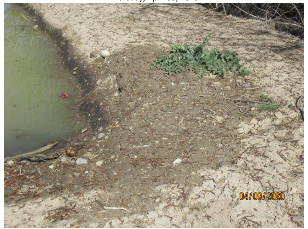
Photograph 41 :Close-up view of Swale #3, northeast end.