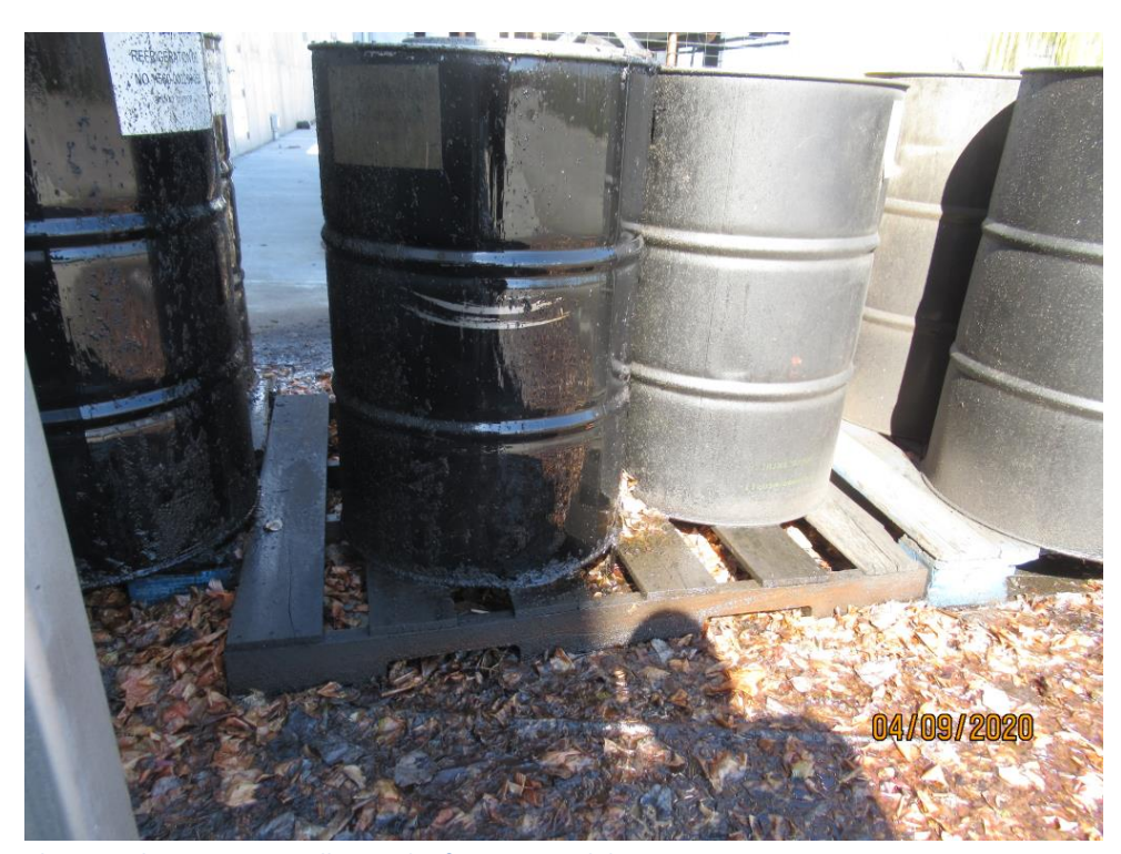
Photograph 48 :Storage pallets and refrigeration oil drums.