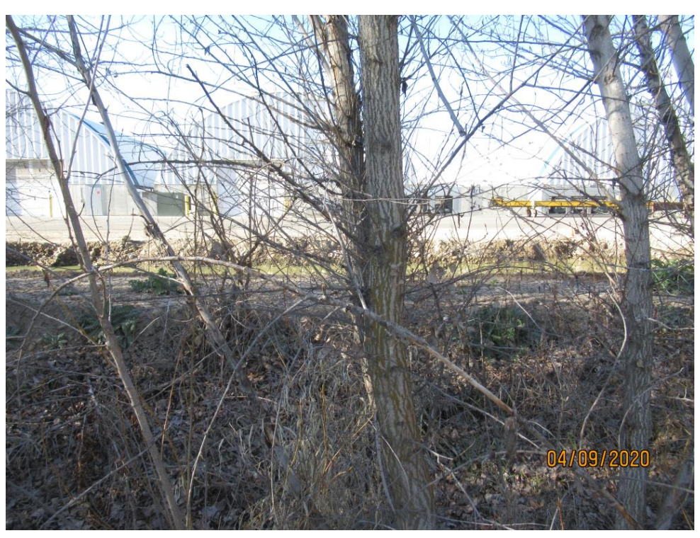
Photograph 10 :Stormwater swale, through vegetation, north side of the facility, looking at the central area facing south.