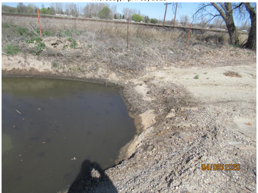
Photograph 67 :Swale #4, north end, looking northwest.