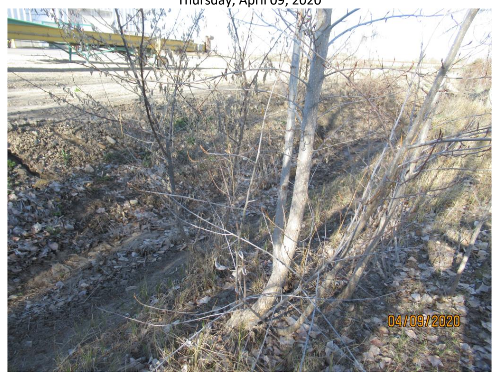
Photograph 13: Irrigation ditch on north side of the property, looking west.