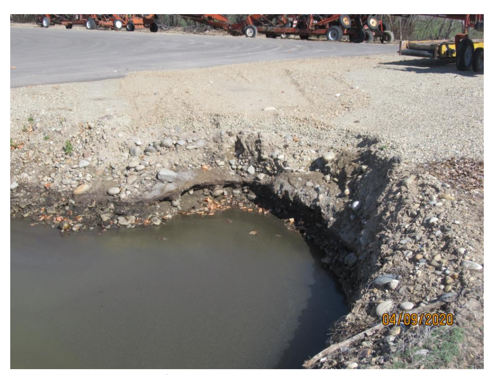
Photograph 36 :Close-up view of erosion area, Swale #2, north end.