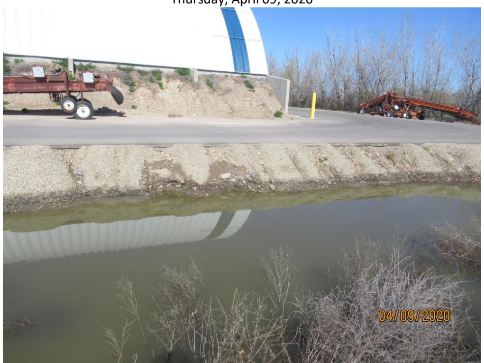
Photograph 33: Swale #2, north end, looking northwest.