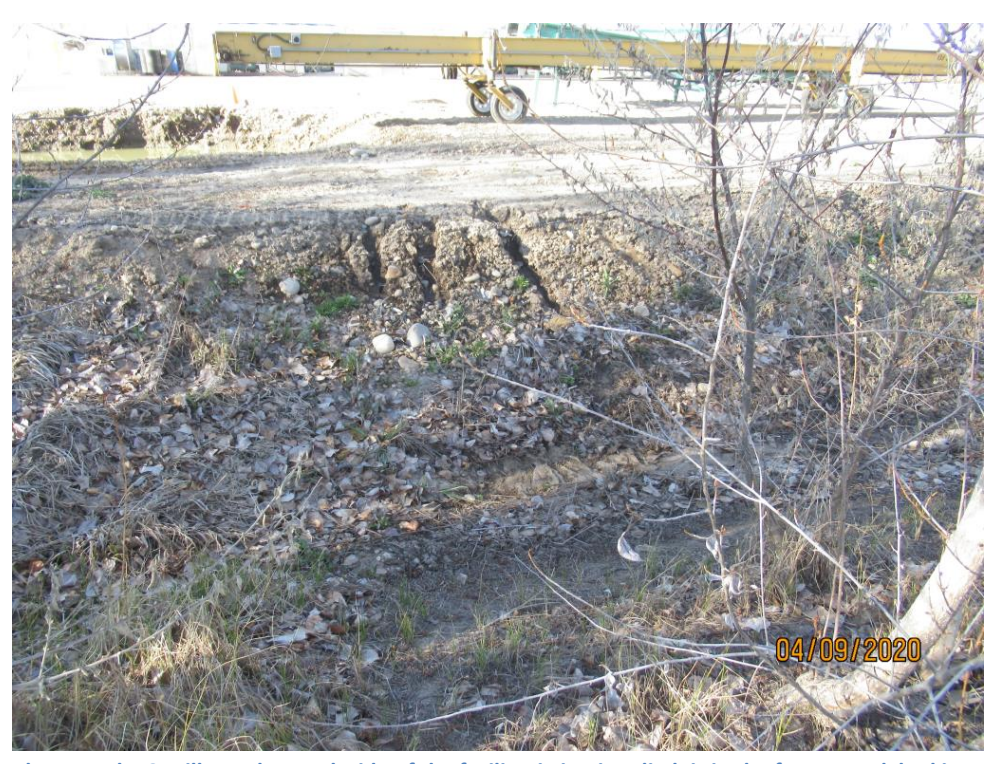
Photograph 12 :Rills on the north side of the facility, irrigation ditch is in the foreground, looking south.