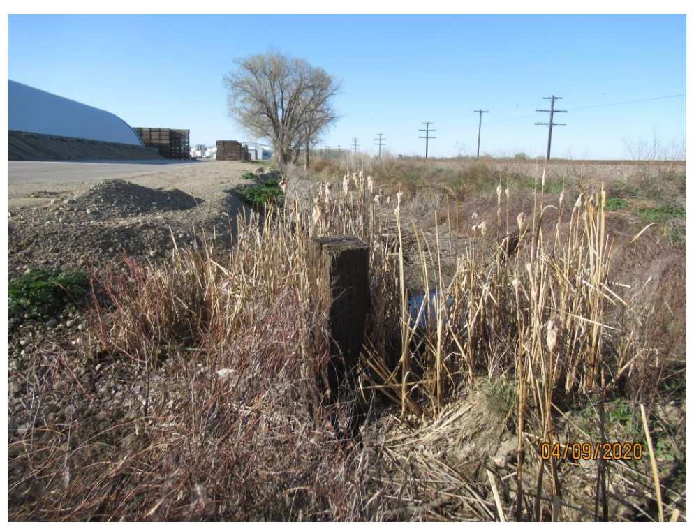
Photograph 18: Irrigation ditch on the west side of the property, north side and west side irrigation ditches meet in the foreground, looking southwest.