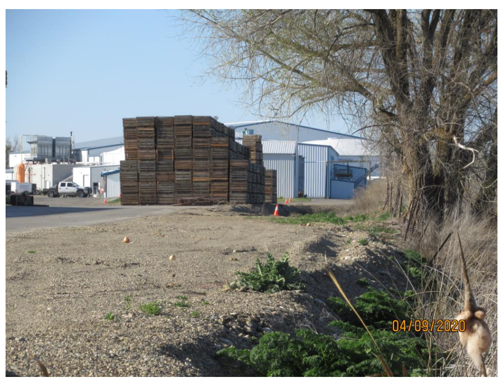
Photograph 20 :Stormwater swale located on the west side of the property, looking south.