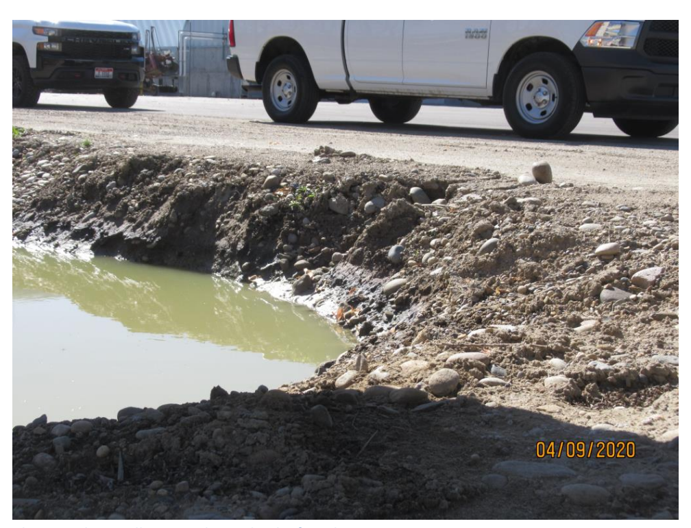
Photograph 54 :Rills on southwest bank of Swale #3.