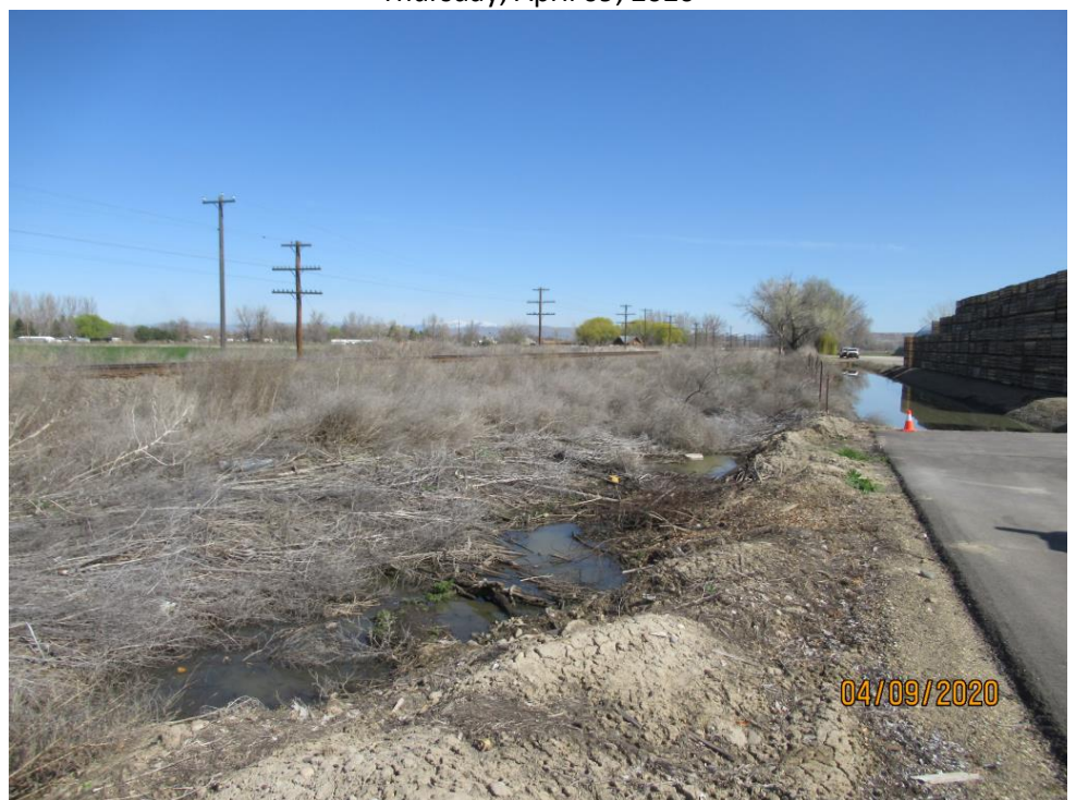
Photograph 73: West side of property looking at pooling water and Swale #4, facing north.