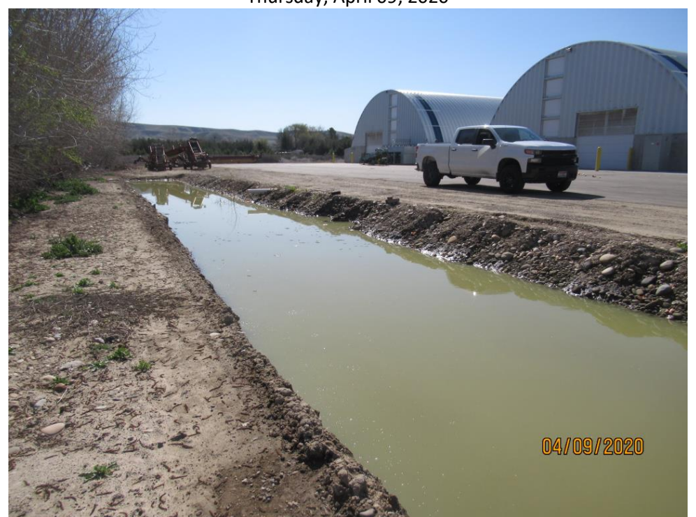
Photograph 55 :Swale #3, looking east.