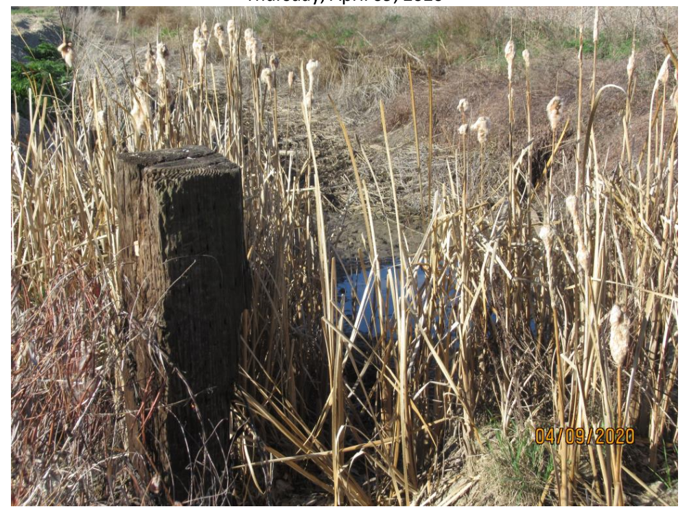
Photograph 19 :Close-up up view of pooling water in west side irrigation ditch, looking southwest.