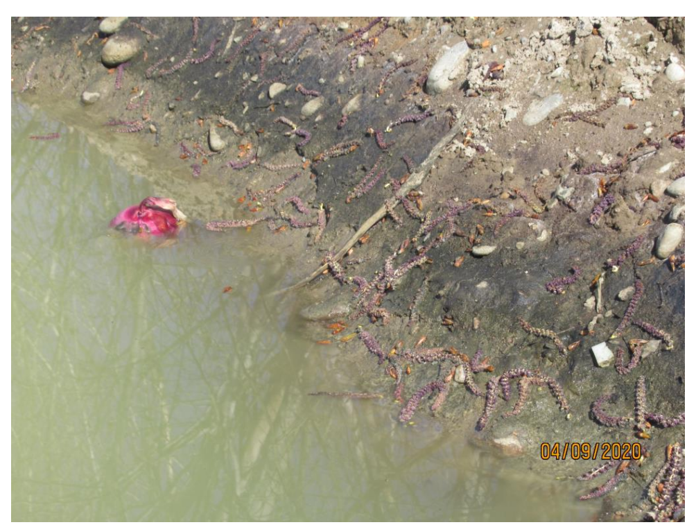
Photograph 44 :Close-up view of Swale #3, northeast end, note discoloration of soil, appears to be oil or petroleum based.