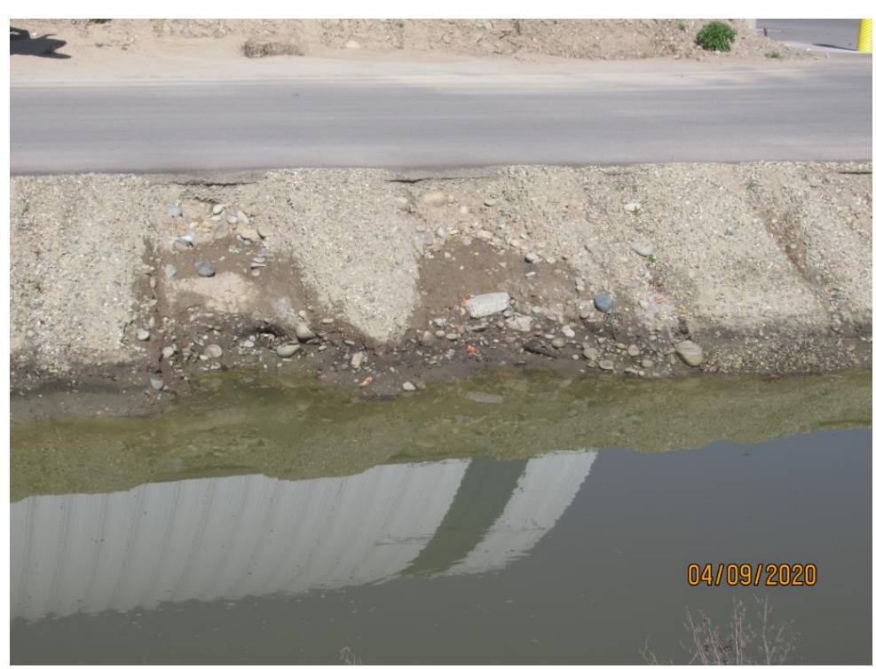
Photograph 34 :Close-up view of north end rills, Swale #2.