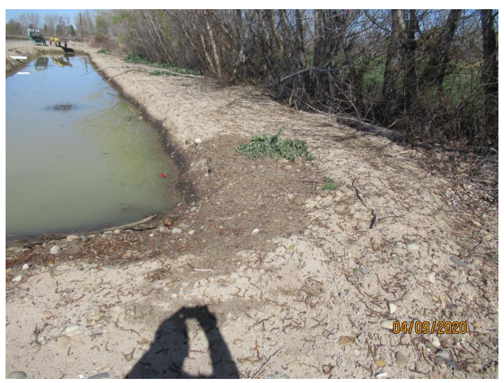
Photograph 40 :Swale #3, northeast end, looking northwest.