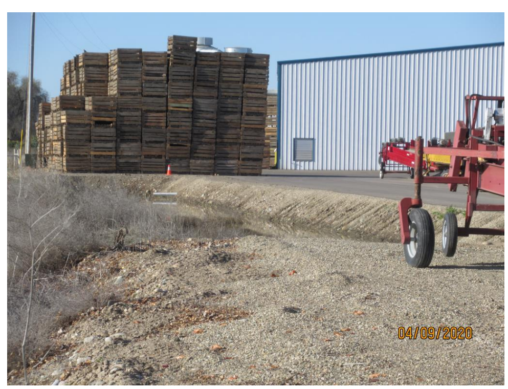
Photograph 2 :Close up view of stormwater swale located on the northeast side of the facility, looking south.