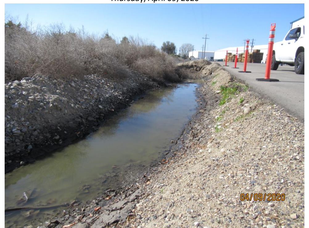
Photograph 23 :Close-up view of Swale #1, looking southwest.