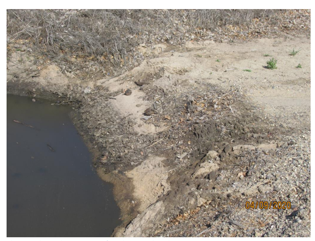
Photograph 68 :Close-up view of Swale #4 north end.