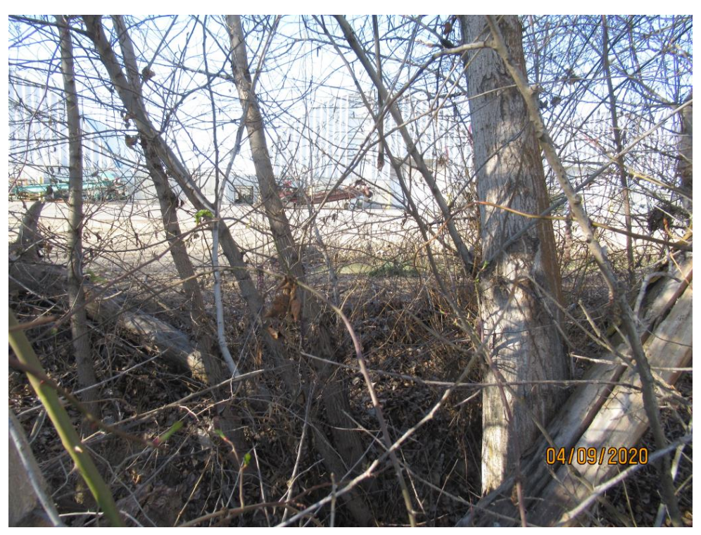
Photograph 8 :Stormwater swale located on the north side of the facility, looking through vegetation facing south.