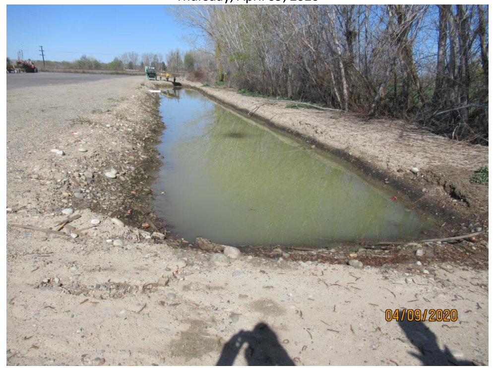
Photograph 39 :Stormwater swale, Swale #3, located on the north side of the property, looking northwest.