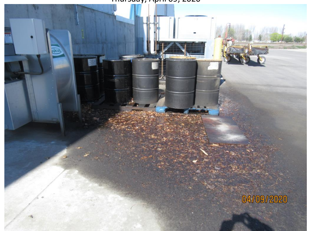
Photograph 45 :Refrigeration oil drums, stored on the north end of the property, near Swale #3. Facility representative indicated the drums contained used oil.