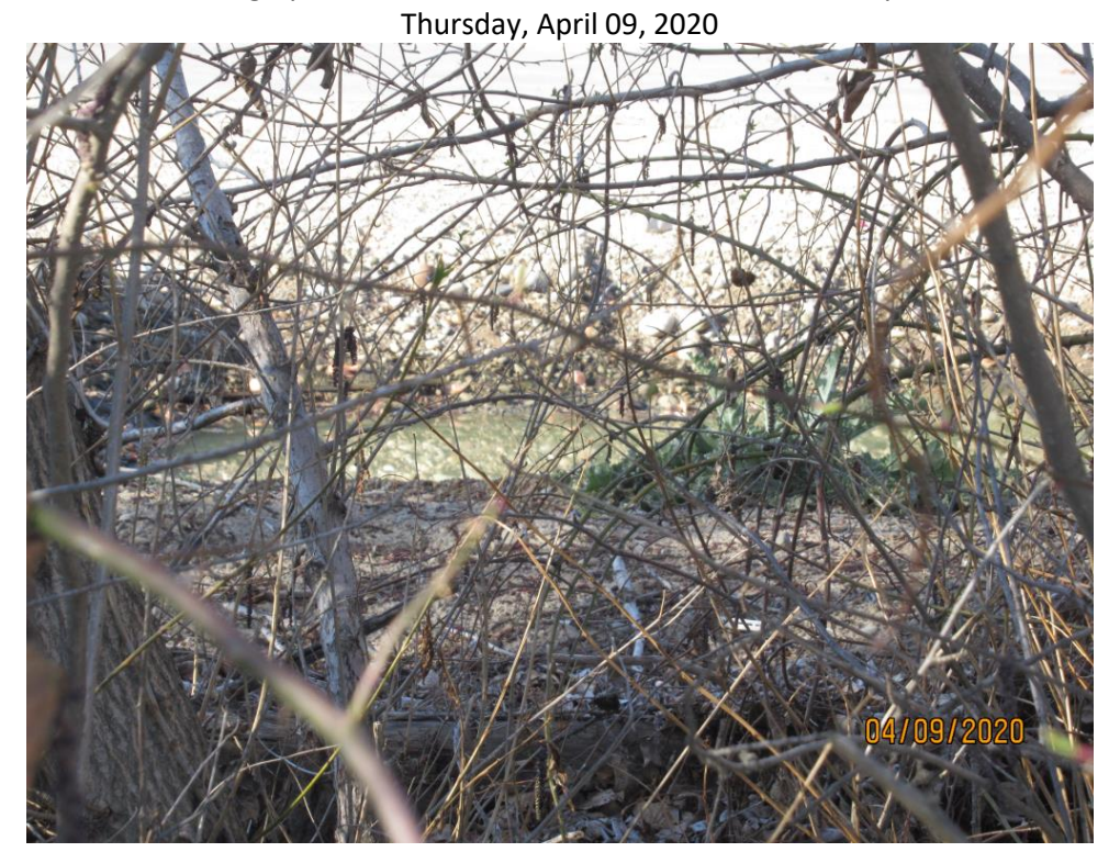
Photograph 9 :Close-up view of stormwater swale located on the north side of the facility, looking through vegetation facing south.