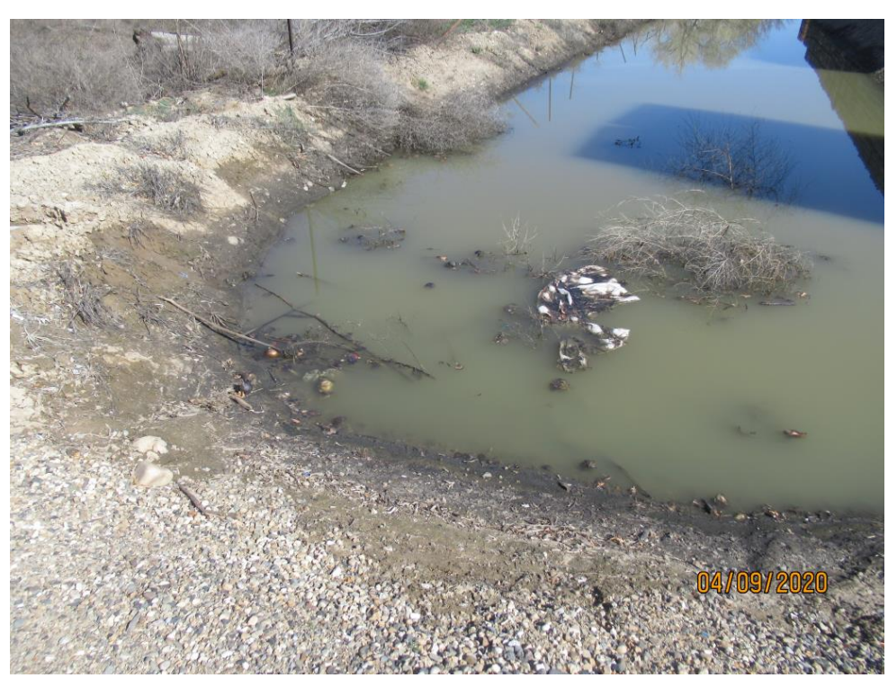
Photograph 70 :Close-up view of Swale #4, south end.