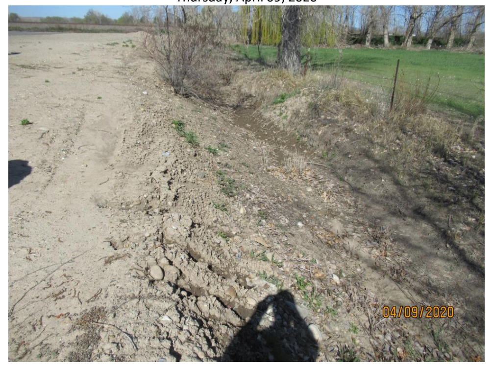
Photograph 57 :Irrigation ditch on north side of property looking west, note moist soil in ditch bottom does not extend to foreground.