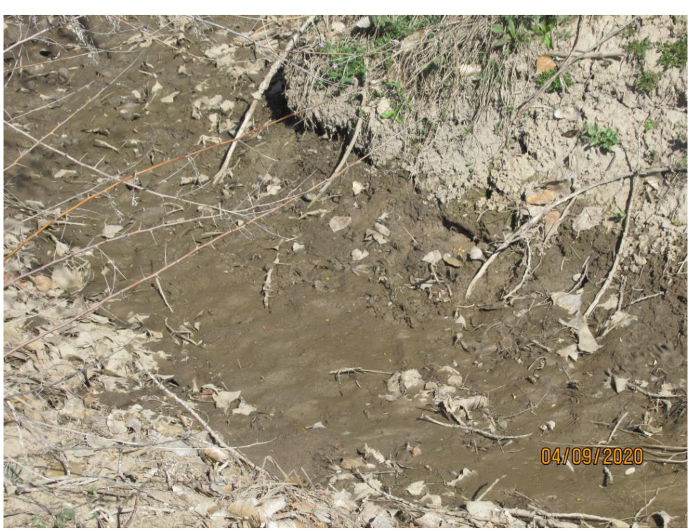
Photograph 60 :Close-up view of moist soil in irrigation ditch north side of property.