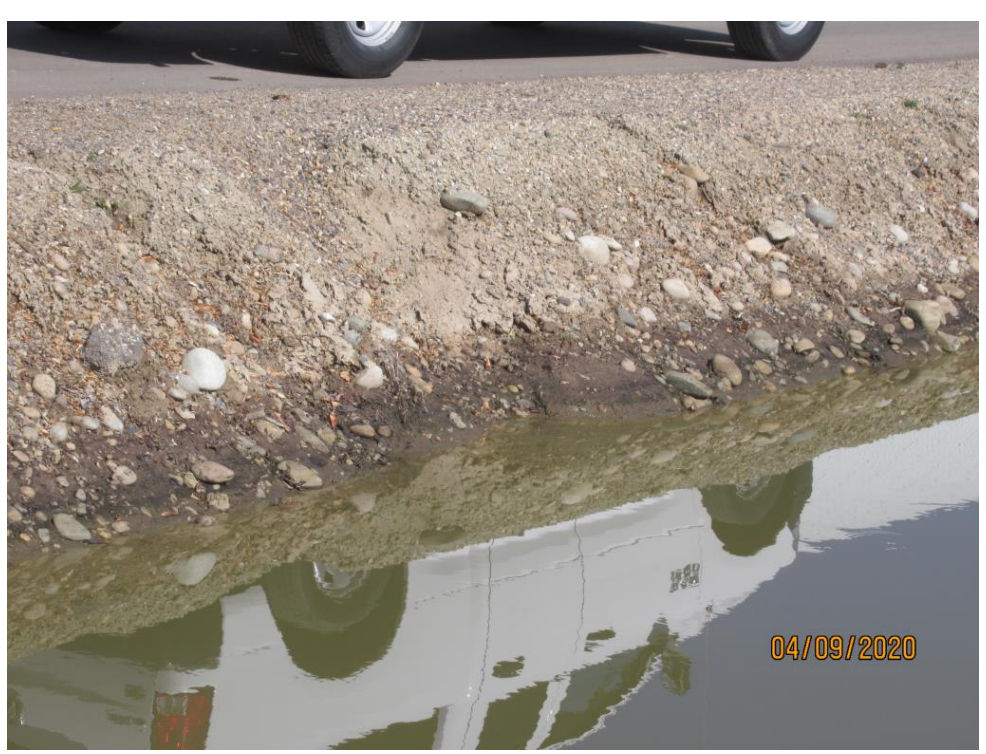
Photograph 30 :Rills on west bank of Swale #2 near south end of the swale.