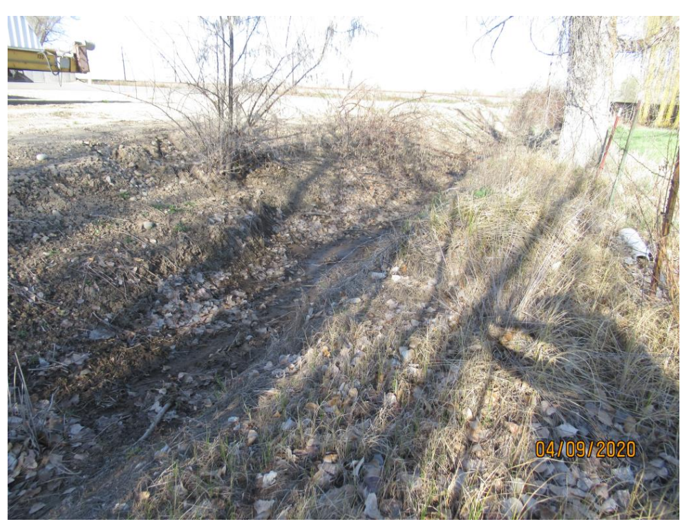
Photograph 14: Irrigation ditch on north side of the property, looking west, moist soil in bottom of irrigation ditch.