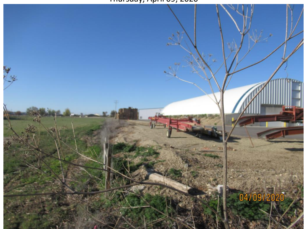
Photograph 1: Stormwater swale located on the northeast side of the facility, looking south.