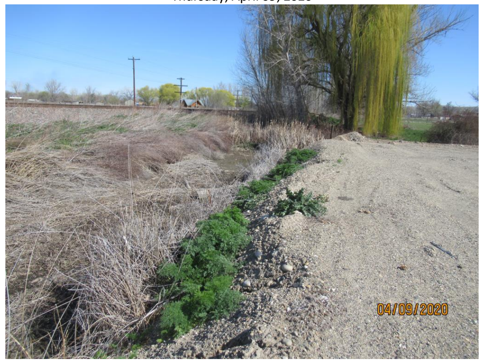
Photograph 63: Irrigation ditch on west side of property looking north.