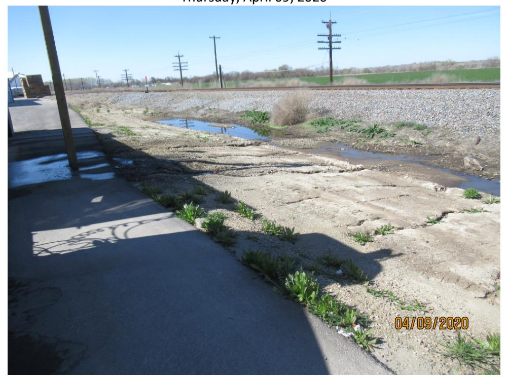
Photograph 75 :View from waste water truck loading station looking west southwest.