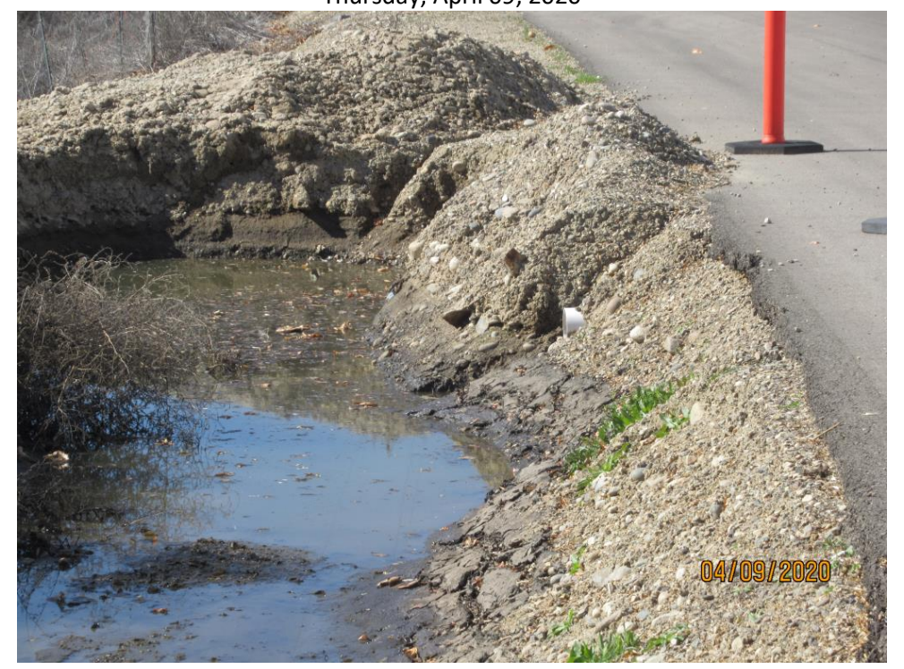
Photograph 25 :Stormwater outfall to Swale #1, looking southwest.