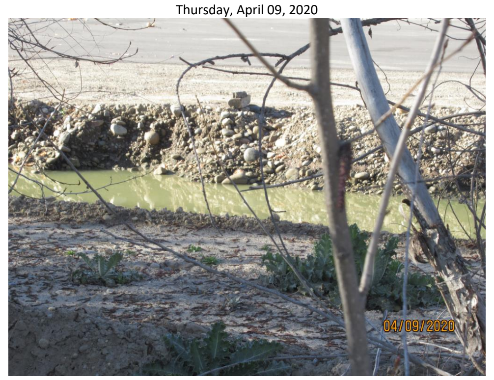
Photograph 11 :Close-up view of stormwater swale, through vegetation, north side of the facility, looking at the central area facing south.