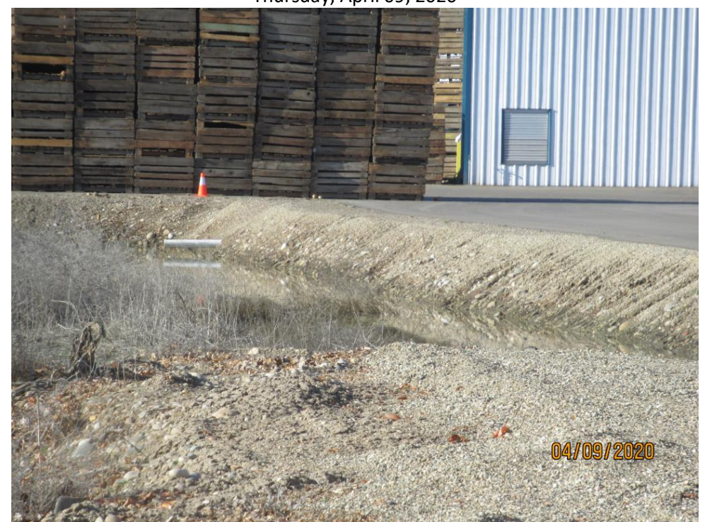
Photograph 3 :Close up view of outfall pipe to stormwater swale located on the northeast side of the facility, looking south.