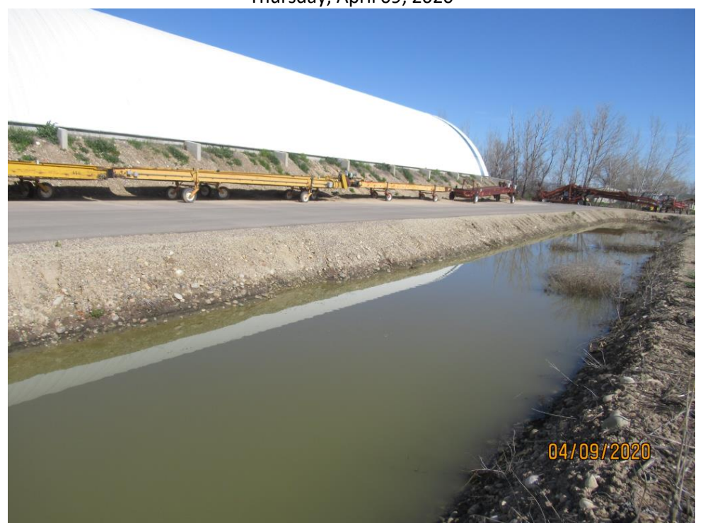
Photograph 31 :Swale #2, mid-way, looking north, note rills along west bank