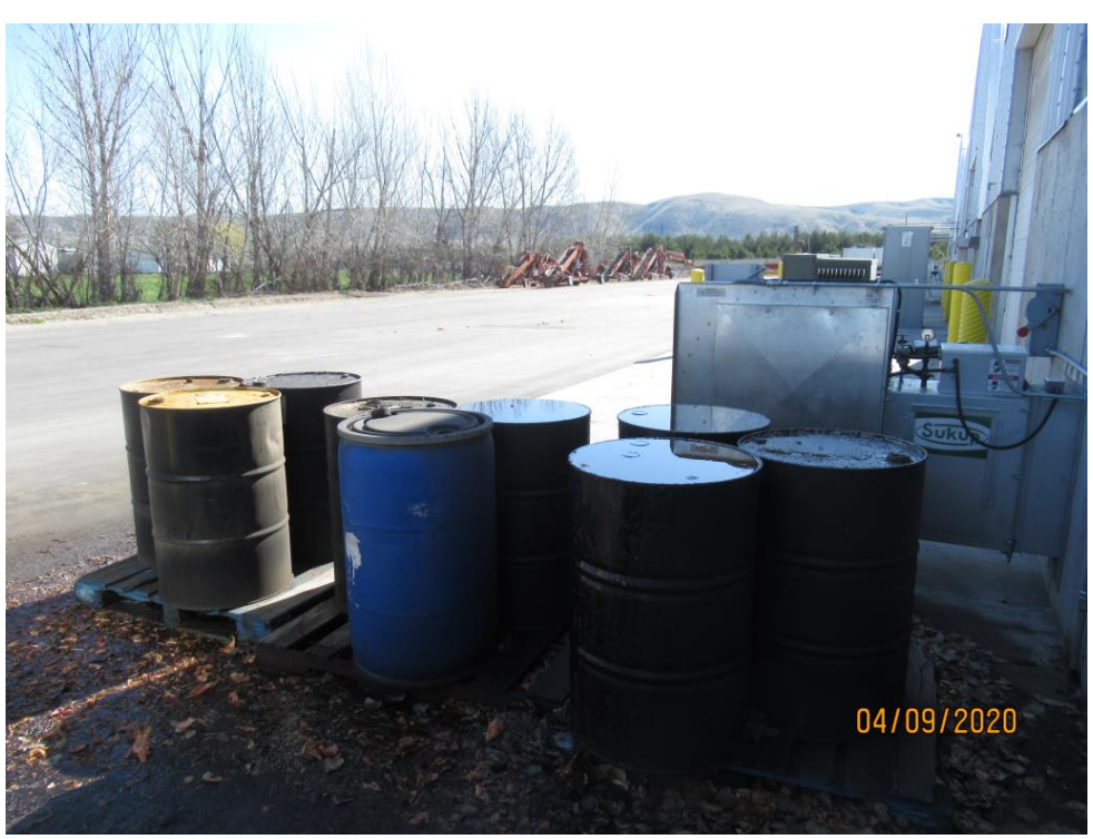
Photograph 50 :Refrigeration oil drums, stored near Swale #3, looking east.