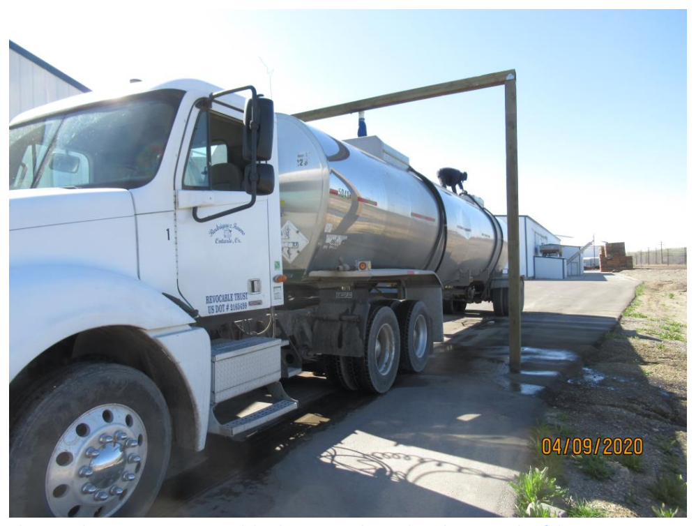
Photograph 74: Waste water truck loading station located on the west side of the property.