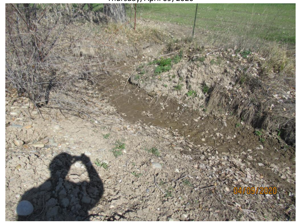
Photograph 59: Irrigation ditch and moist soil on north side of property, looking north.