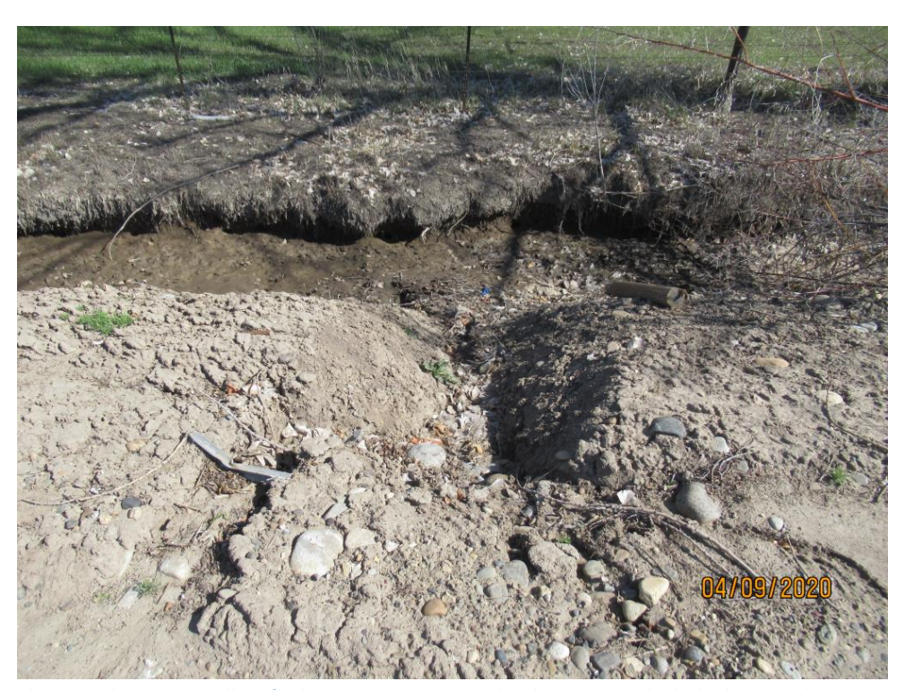
Photograph 62 :Large rill on facility property into north side irrigation ditch, looking north.