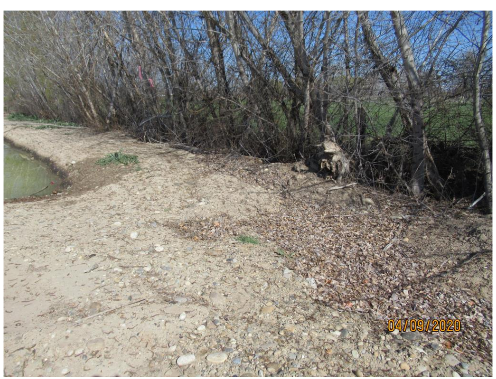
Photograph 42 :Irrigation ditch and vegetation on the north side of the property near Swale #3.