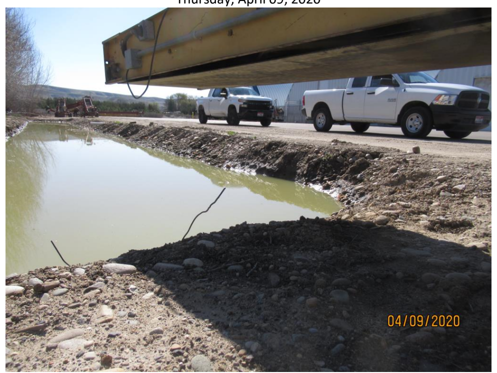
Photograph 53 :Swale #3, west end of the swale, looking east, second view.