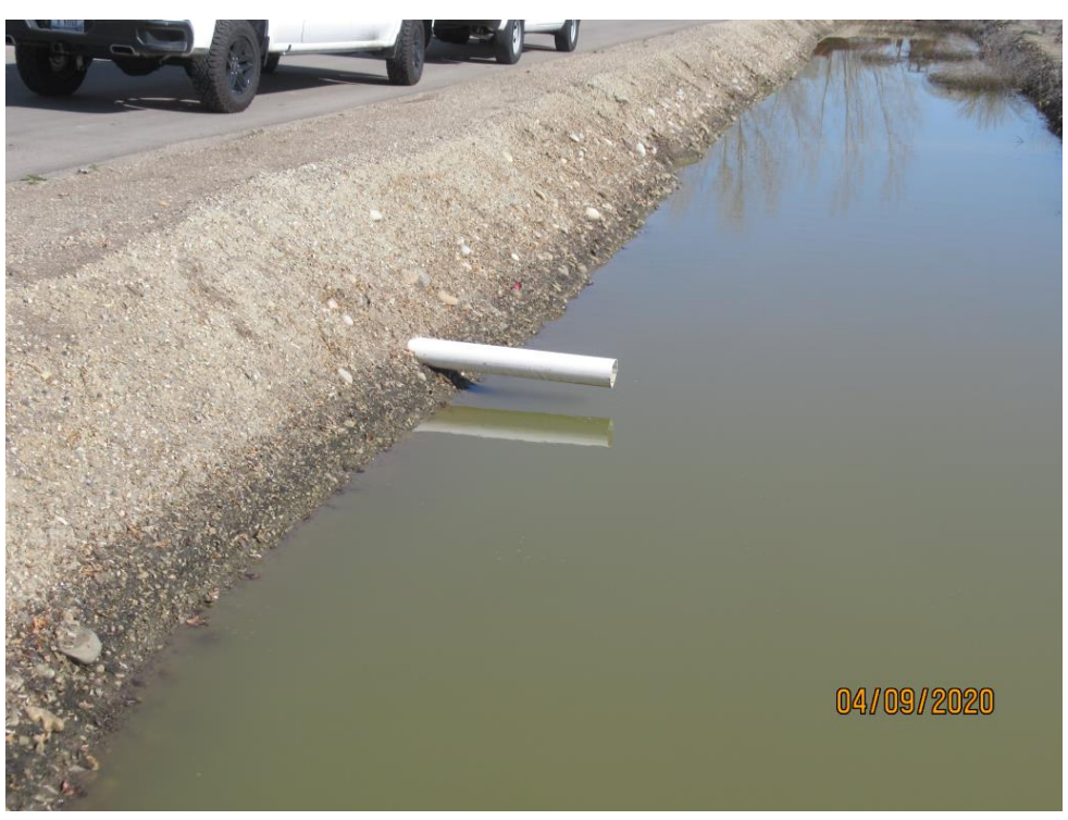
Photograph 28 :Stormwater outfall to Swale #2, looking north.