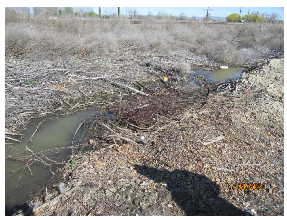
Photograph 72 :West side of property near waste water truck loading station, between station and Swale #4, looking northwest.