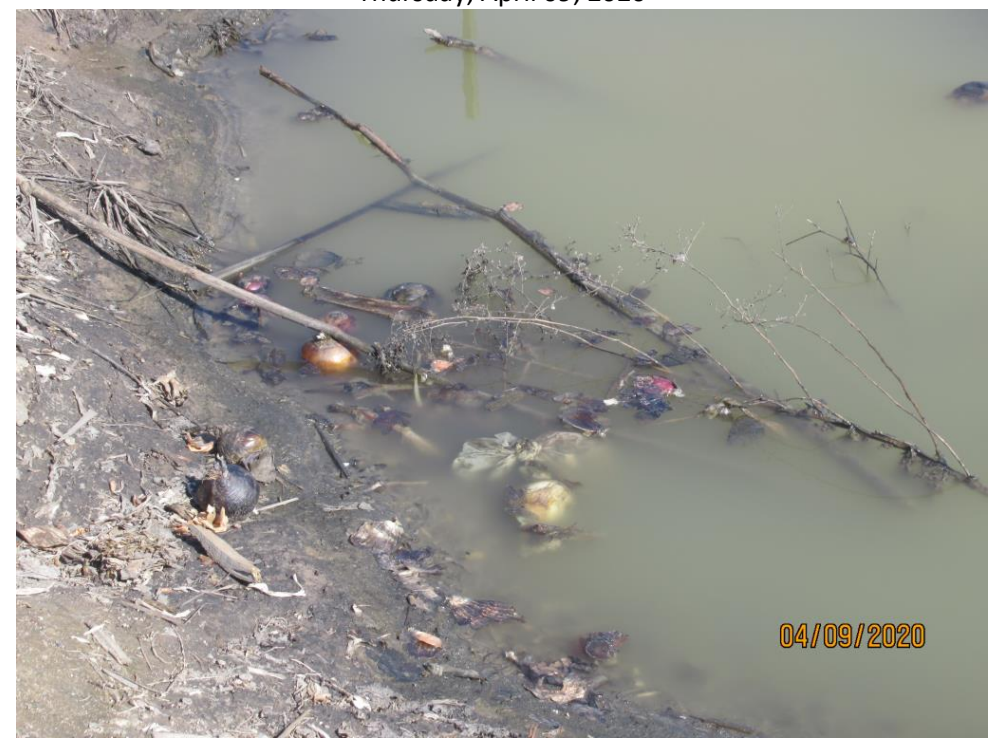
Photograph 71 :Close-up view of Swale #4, note onions and debris.