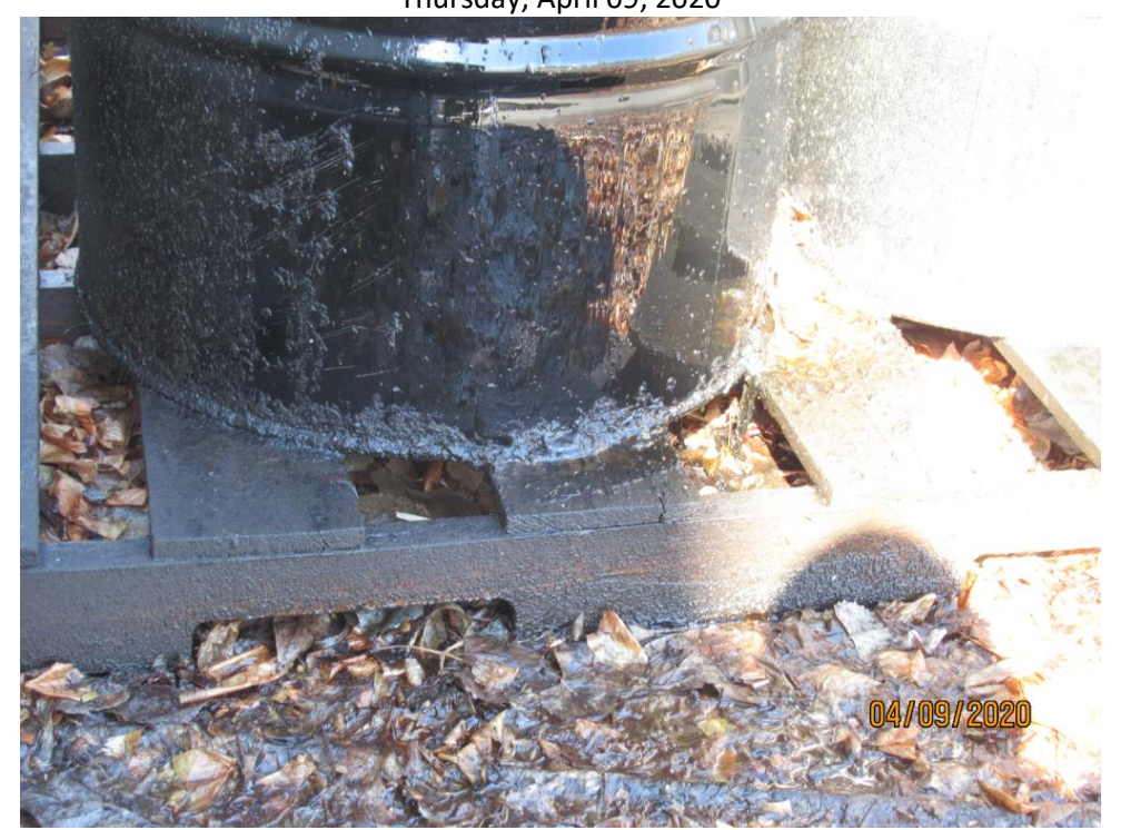
Photograph 49 :Leaking oil from refrigeration oil drums on to storage pallets.