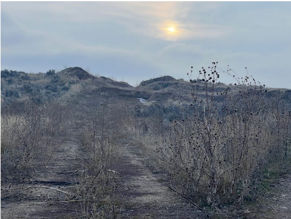
Now: January 2nd, 2024