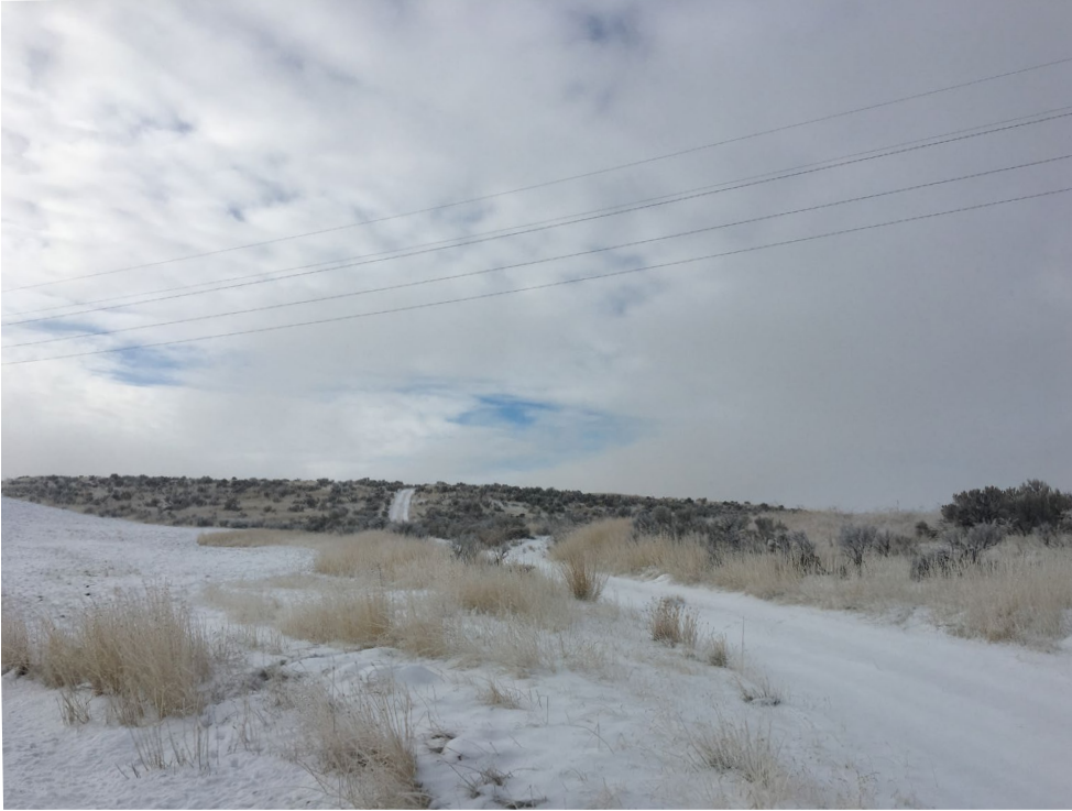
Before: December 26th, 2017