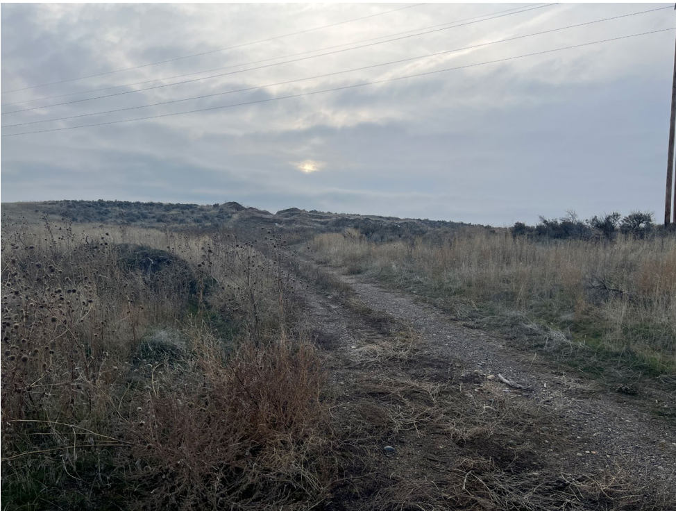
Now: January 2nd, 2024