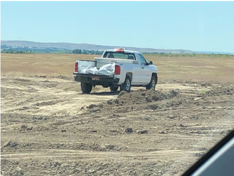
STRATA truck with white bags full of material