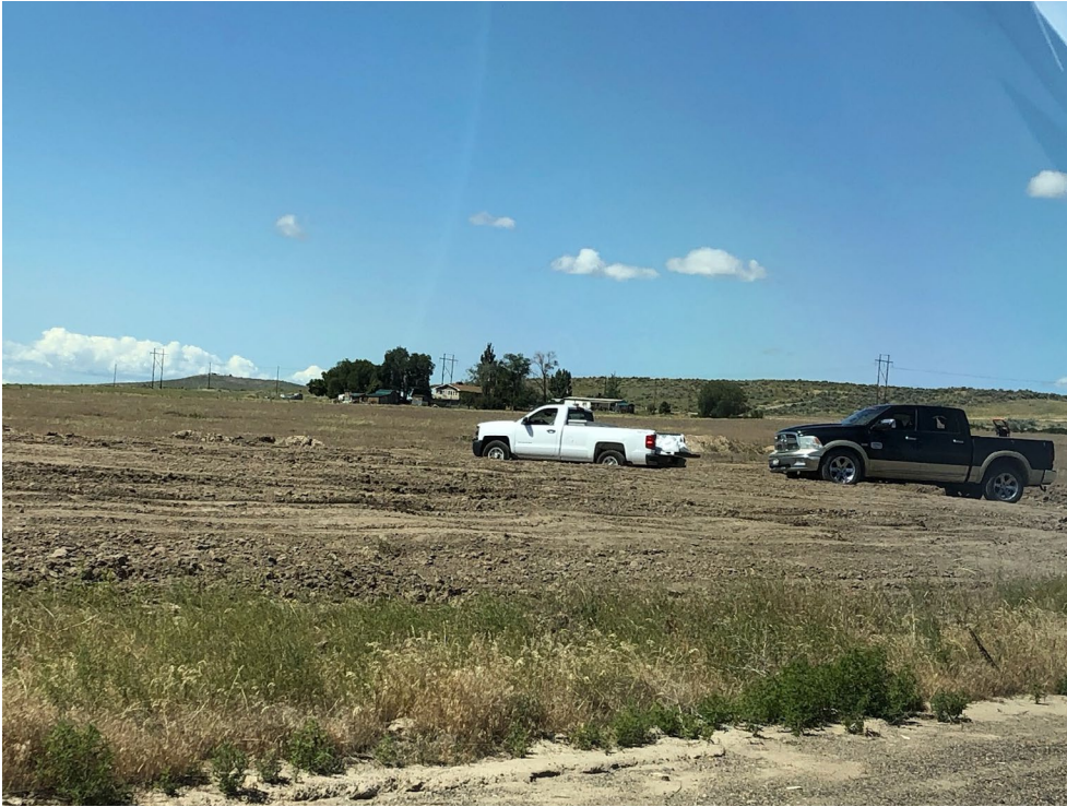
STRATA (white truck) and Darren Lee (brown and gold truck) at the site