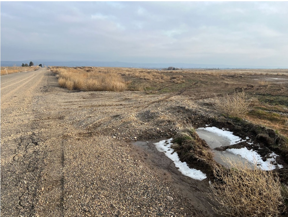
Now: January 2nd, 2024