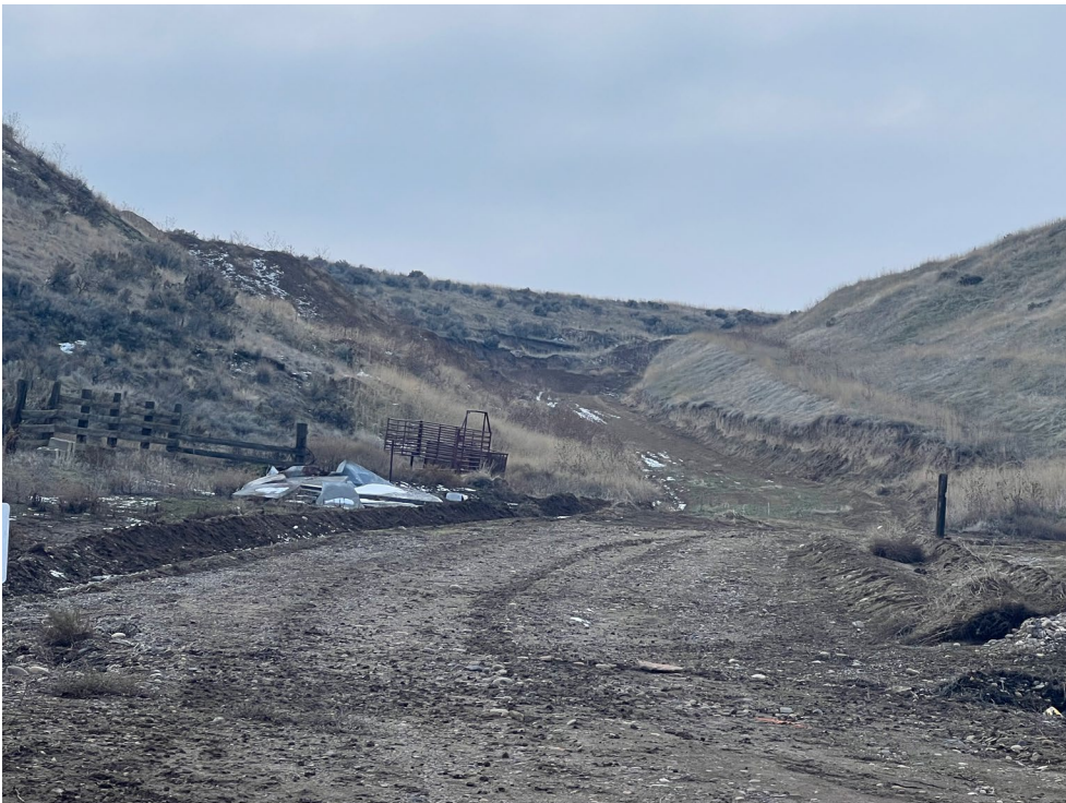
Now: January 2nd, 2024