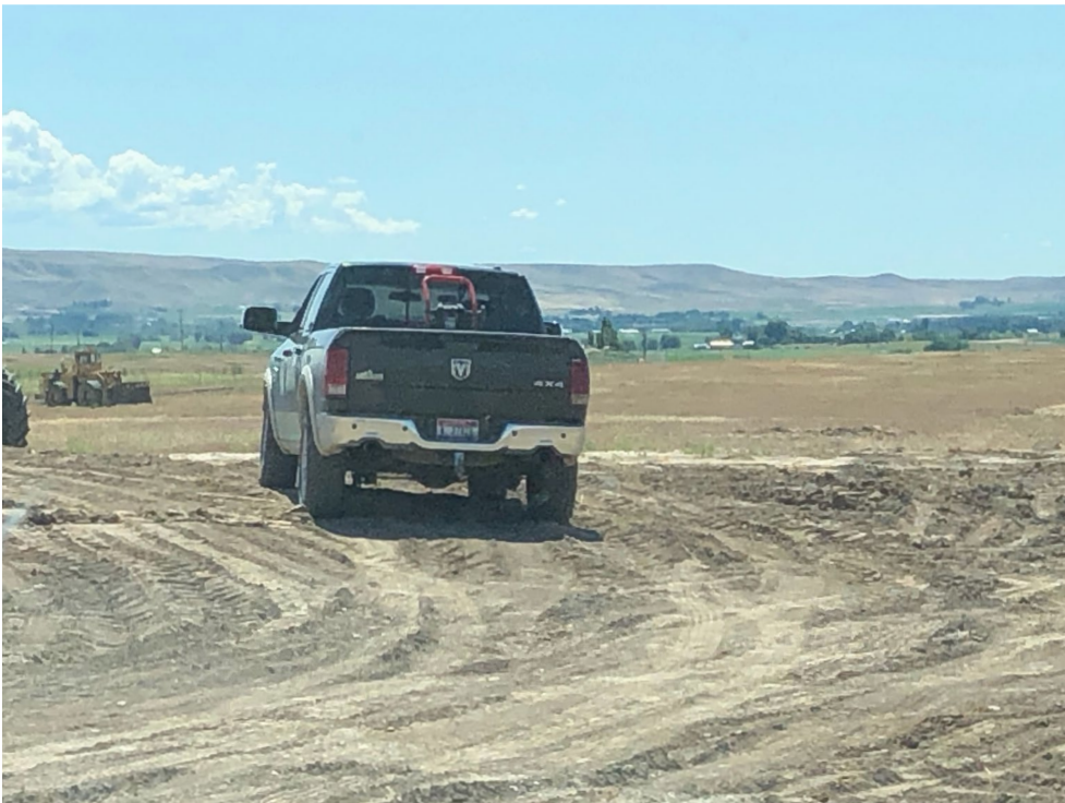
Darren Lee's truck on site