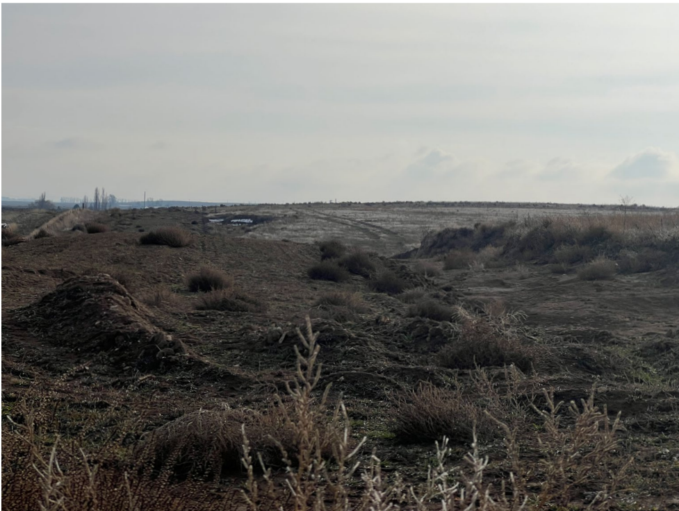
Now: January 2nd, 2024 Same fence line on left