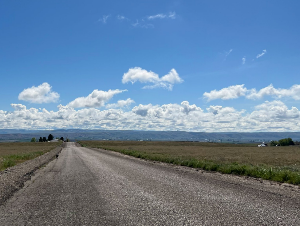
Before: February 18th, 2021