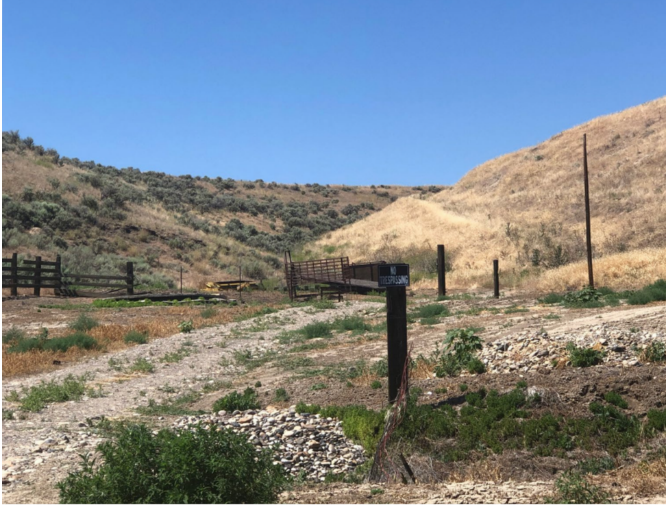
Before: June 23rd, 2021