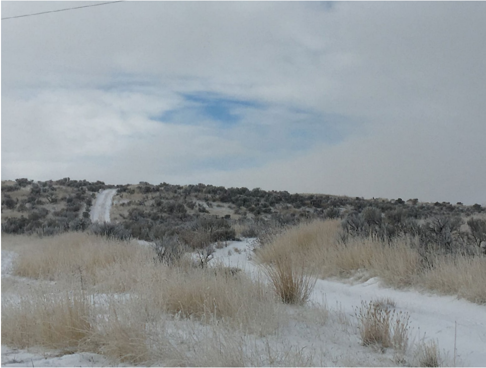
Before: December 26th, 2017