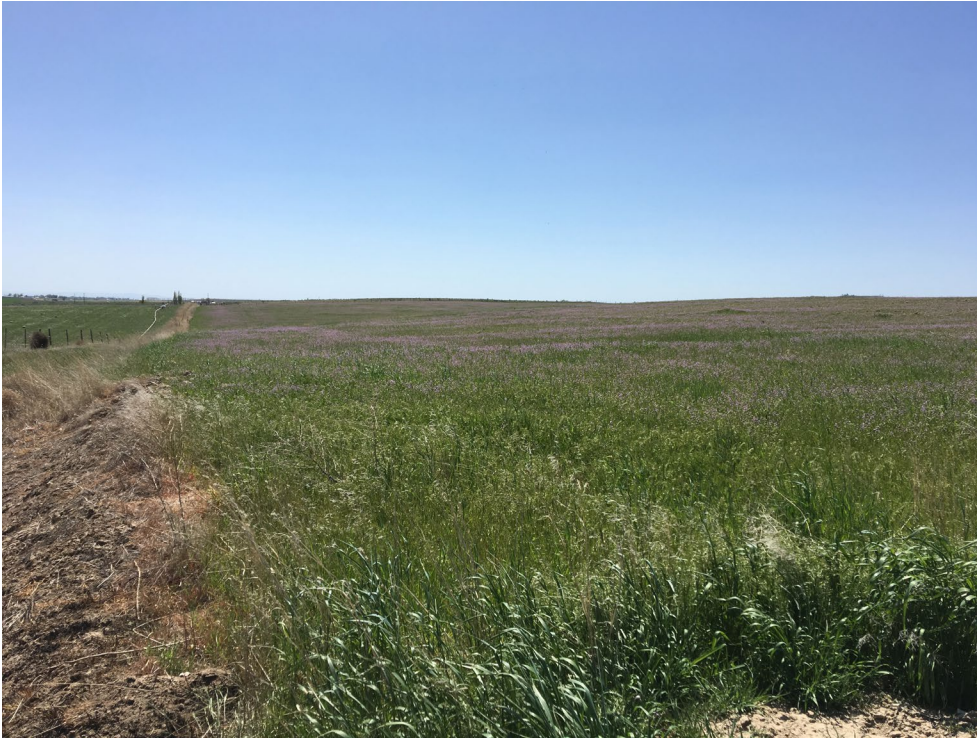
Before: April 18th, 2018 Fence line on left: Hastings property