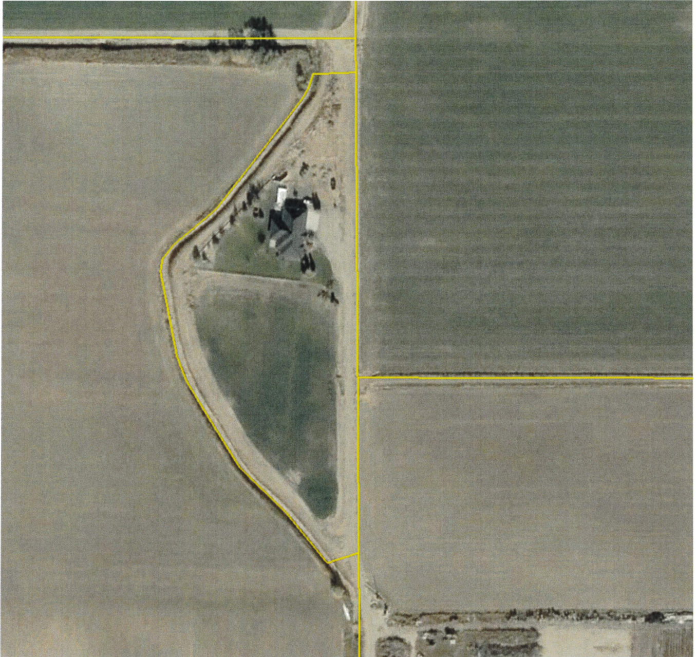
EXHIBIT # 4